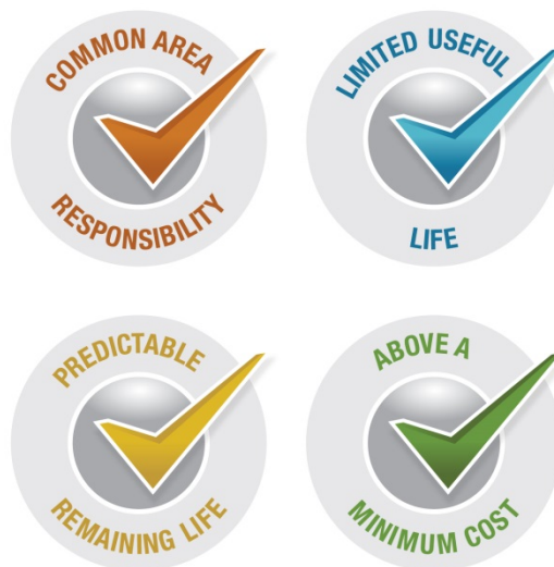
RESERVE COMPONENT “FOUR-PART TEST”

Only components that meet the National Reserve Study Standards (NRSS) four-part test (see below) should appear in the Reserve Study: